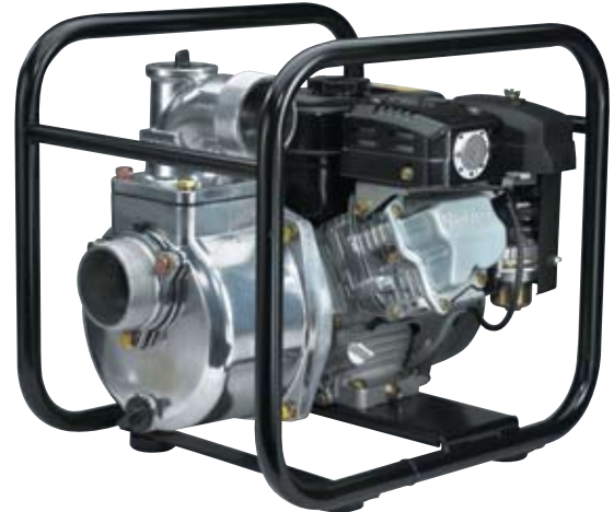
SE-80EX ROBIN ENGINE