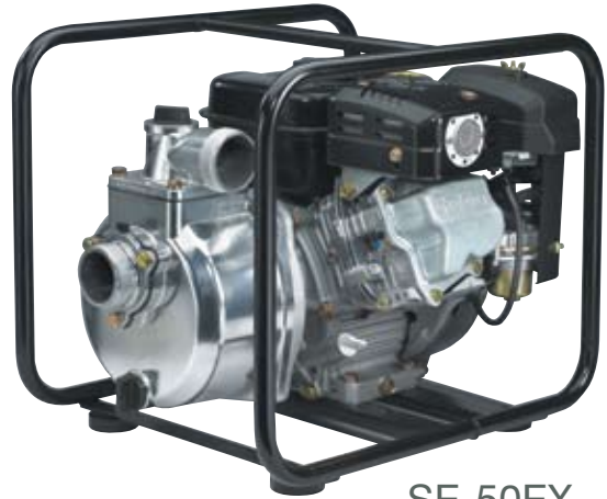
SE-50EX ROBIN ENGINE