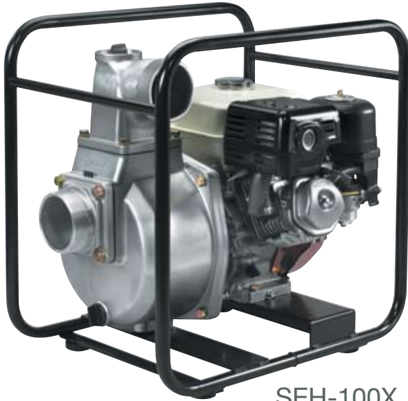
SEH-100X HONDA ENGINE