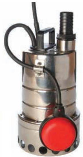
Mizar VOX auto